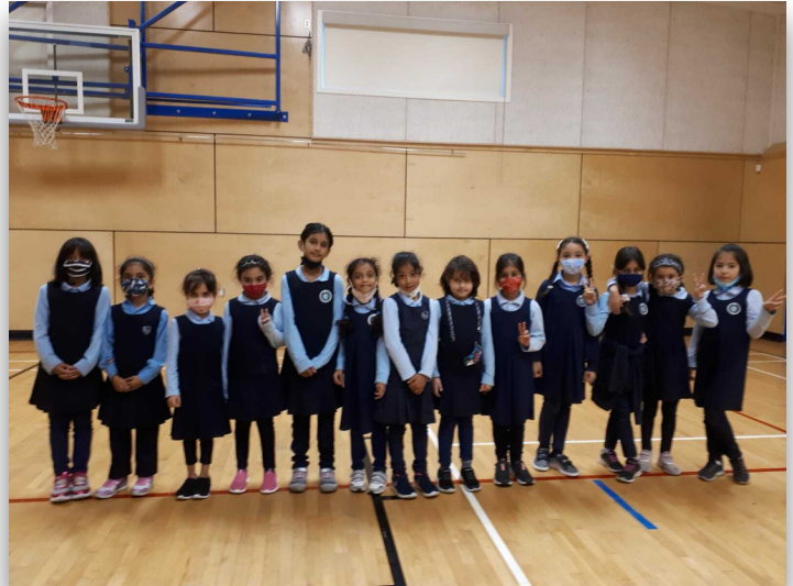
Grade 1 Division 2 students having fun during gym time with the parachute. They enjoyed playing games and incorporating various locomotor skills