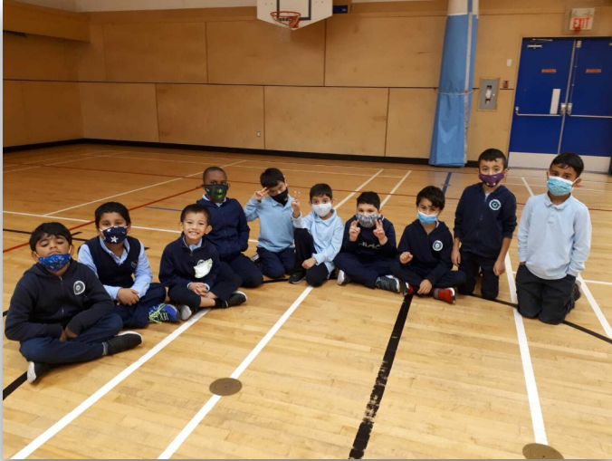
2-1 students listening to gym rules.